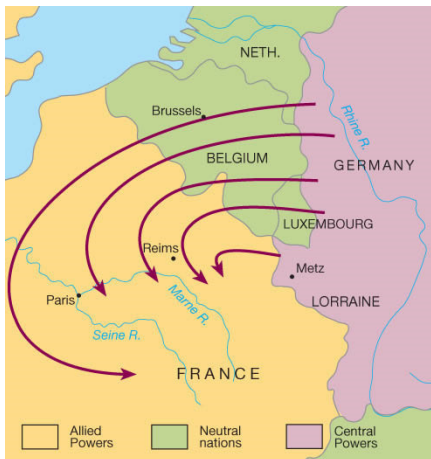
The Schlieffen Plan