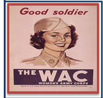
Women at War