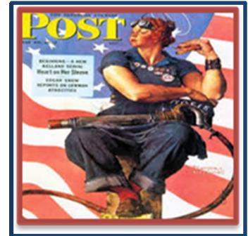
Women In the US